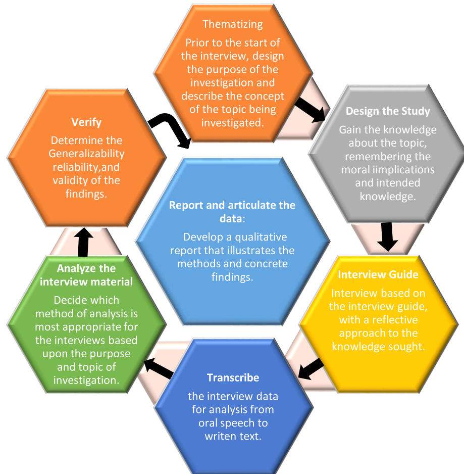
Figure 4. Kvale's Seven Stage Interview Process Used in the Data Collection Process