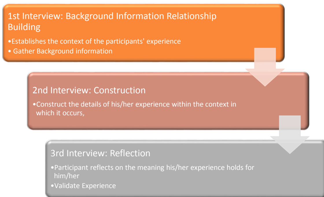
Figure 5. Seidman’s Three Stage Interview Process Used in the Data Collection Process

During the interviews, it was important for the researcher to take extensive notes and to process and clarify where necessary. The handwritten notes included observable behaviors that could not be tape-recorded during the interview process, such as body language, intonation, and gestures. Extensive note taking validated the experiences by the participants' behaviors or gestures. The researcher integrated Kvale’s seven-stage interview process with Seidman’s three-stage interview process to collect, transcribe, analyze, and report the data during the data collection process over a period of 4 months. Thematizing, designing, the study, and developing the interview guide are the first three steps in Kvale’s seven-stage interview process.